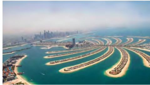
Palm Islands In Dubai