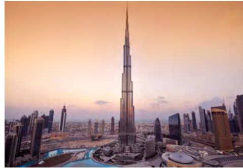
Burj Khalifa In Dubai