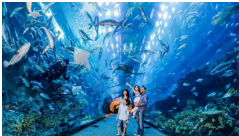
Aquarium and Underwater Zoo In Dubai