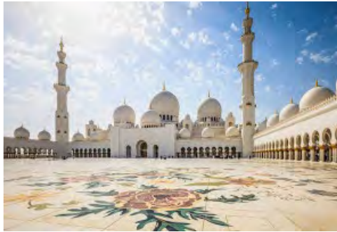
Sheikh Zayed Grand Mosque in Abu Dhabi