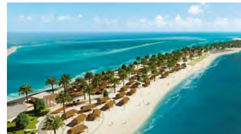
Sir Bani Yas