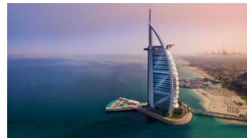
Burj al-Arab In Dubai