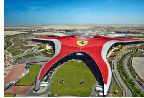
Ferrari World in Abu Dhabi