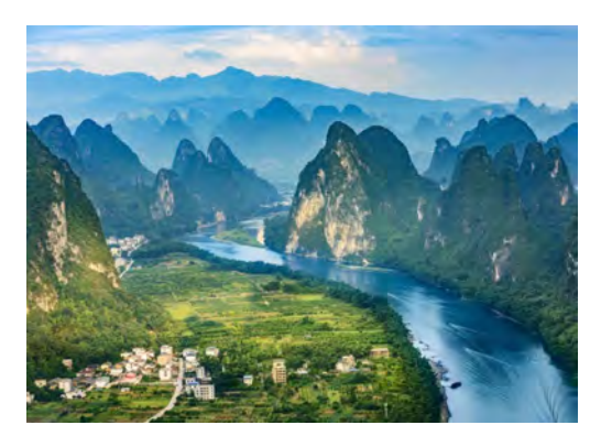
Yangshuo, Guilin, China

Best Time to Visit Tam Coc is from May to July /September to October when all Tam Coc rice fields are in harvest season.