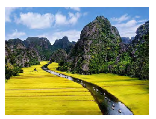
Tam Coc (Ninh Binh) Vietnam